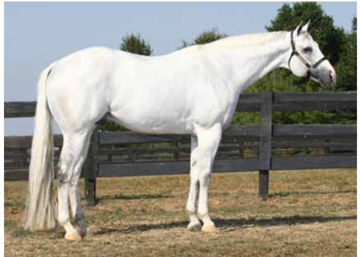
HBF Iron Man (AQHA/APHA) Stallion

Registry program has outscored their dam in conformation and movement abilities, according to the criteria set forth by the breed standards.” Indian Artifacts is the only breeding stallion today who is himself an AQHA World Champion, AWR First Premium and an AWR Inspection Champion, and has plainly demonstrated that he is genetically capable of improving the dam through the foal, and therefore improving the breed.