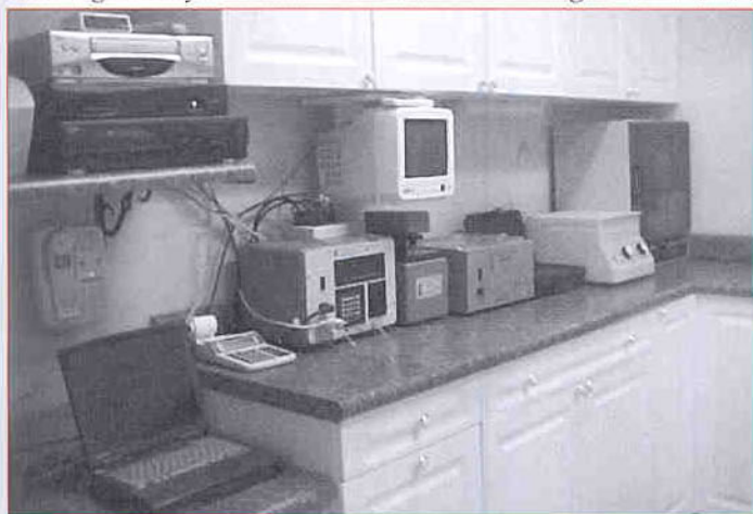
DeGraff Stables offers state of the art breeding technology.