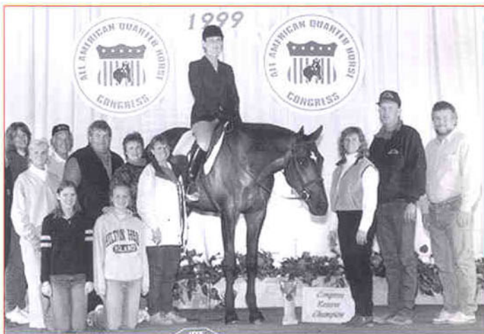
Indian Artifacts at the 1999 Congress